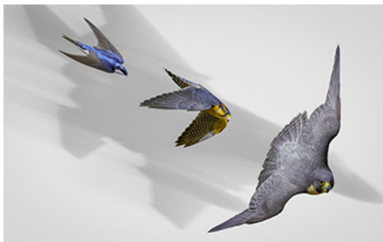
"The Original Blueprint Reflections" Theme "Similitude"