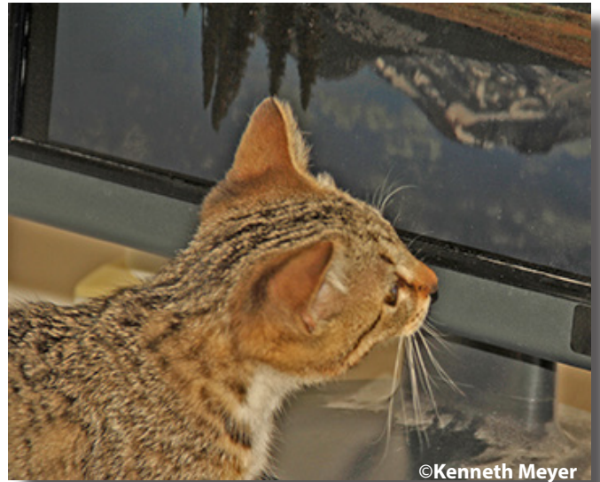
November - Theme Images Humor