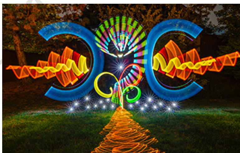
"Yard Lighting" ©Steve Peters Theme "Painting with Light"