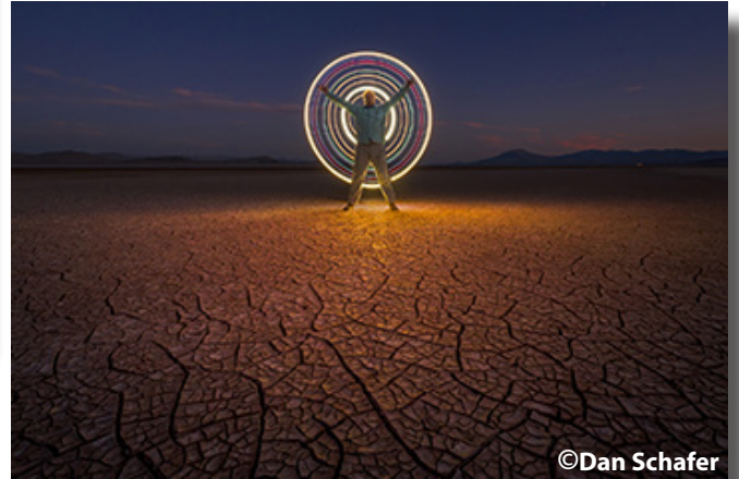
September - Theme Images "Painting with Light"