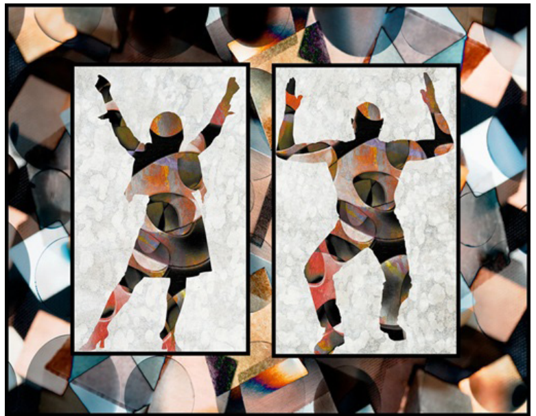
"Boxed In" Theme "Framed"