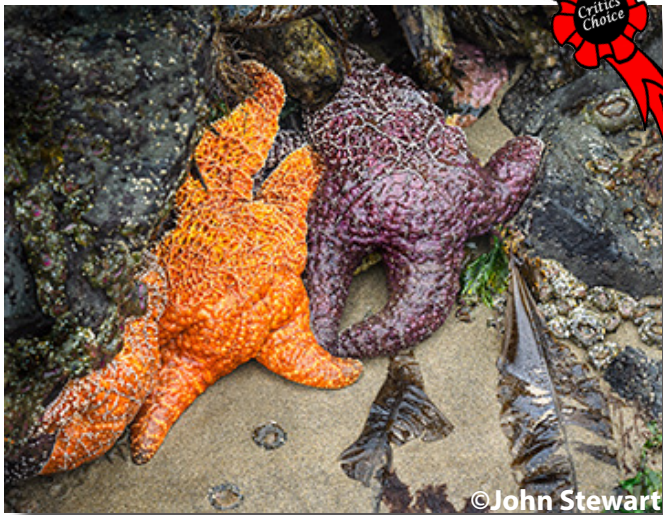
June Theme Images "Odd Couple"