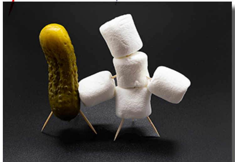
"So Many Differences" Theme "Odd Couple"