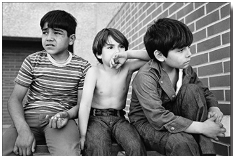
“Three Boys East Los Angeles” ©John Stewart Theme “Black & White”