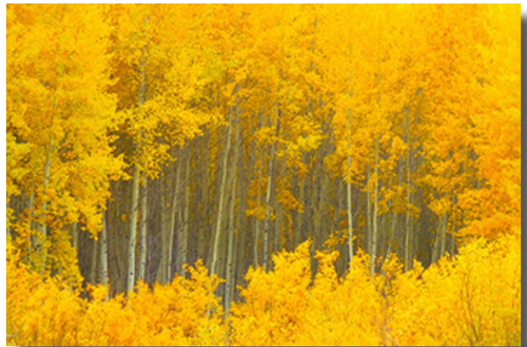
“Mellow Yellow” ©Ruth Baker Theme “Autumn Colors”