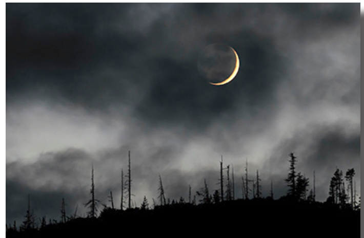
“Burnt Forest” Theme “Smoke/y”