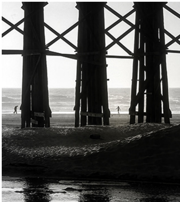
“Train Trestle by the Ocean” Theme “Black & White”