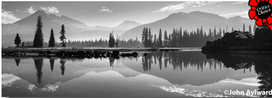
October Theme Images "Black & White"