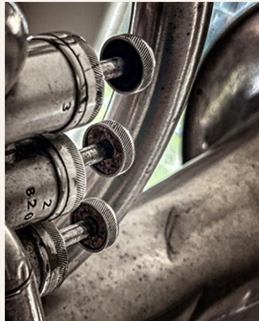
“Baritone” Theme “Musical Instruments”