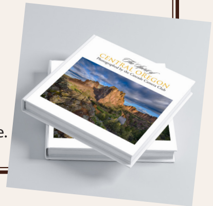
Photo Walk - October 7th

Prints do not need to be only ones from the book, they can be any print you'd like.