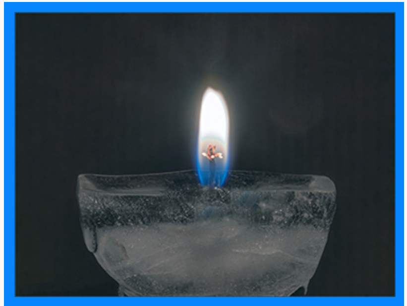
“Fire Ice” ©Jack Schade Theme “Opposites”