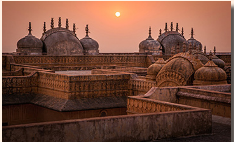
“Nahargarh Fort ” Theme “Architecture”