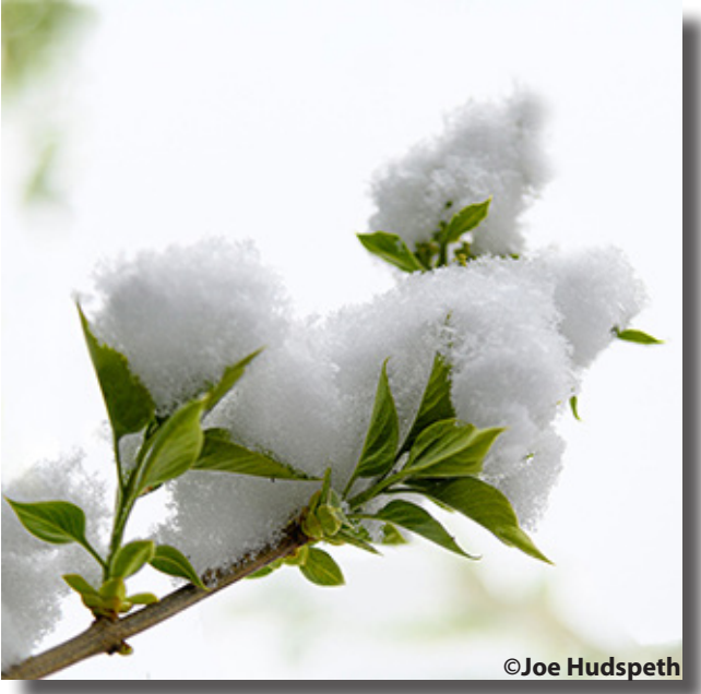
November Theme Images "Snow"