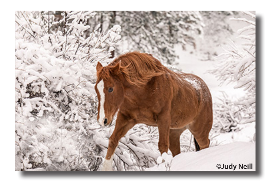
November Theme Images "Snow"