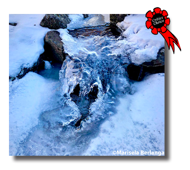
November Theme Images "Snow"