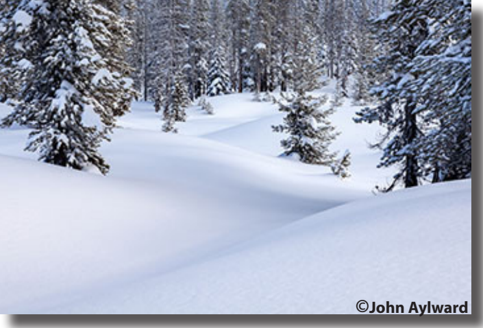
November Theme Images "Snow"