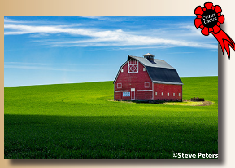
October Theme Images "Barns"