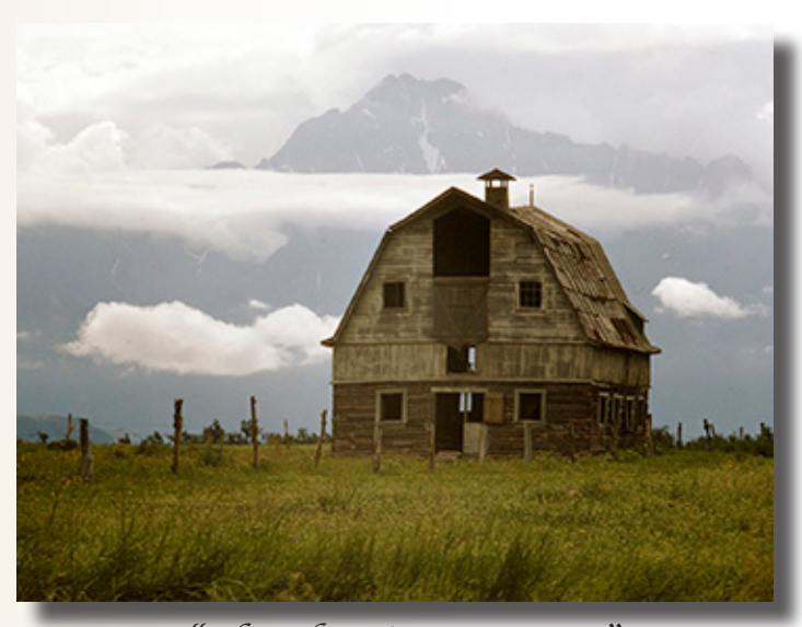
"Ghostly Píoneer Barn" Matanuska Valley Alaska Theme "Barns"