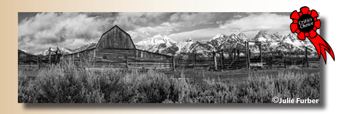
October Theme Images "Barns"