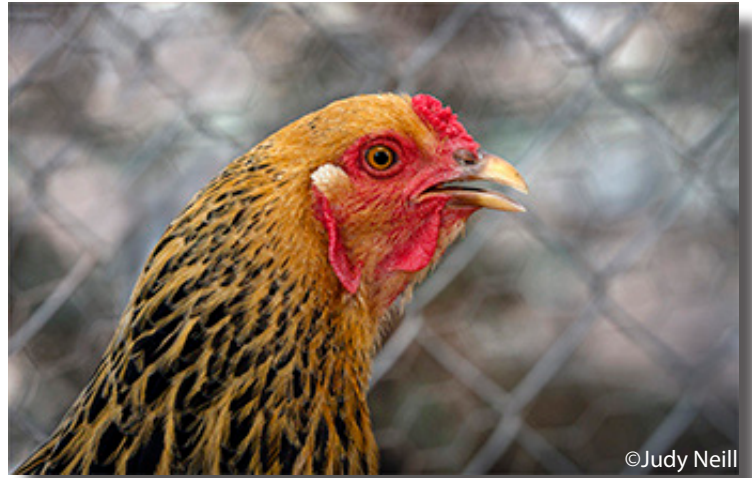
June Images "Feathers"