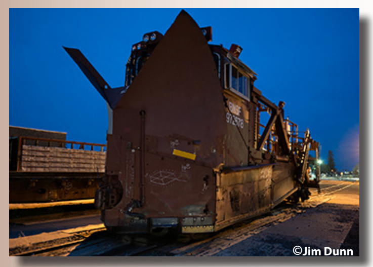
May Images "Anything Railroad"