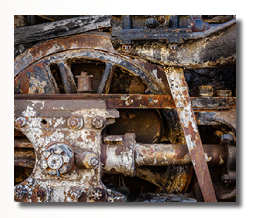
"Elegant Decay" ©Chris Bales Theme "Anything Railroad"