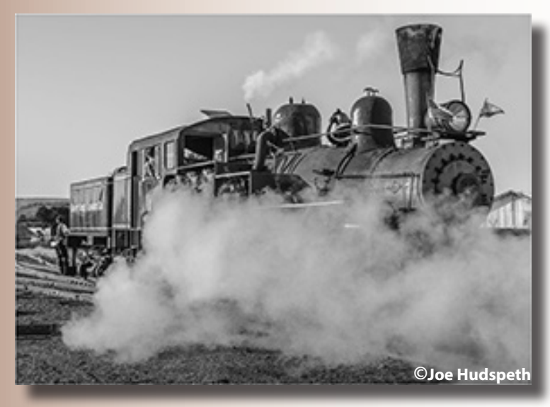
May Images "Anything Railroad"