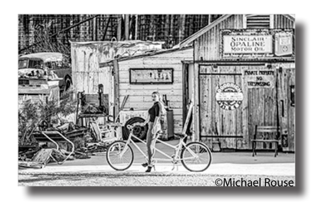
April Images "Black and White"