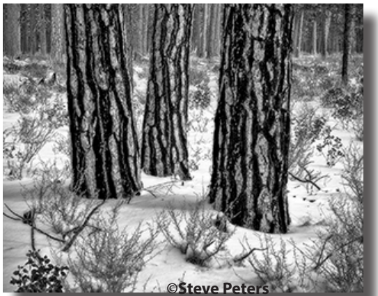
April Images "Black &White"