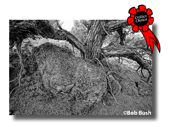
April Open Images