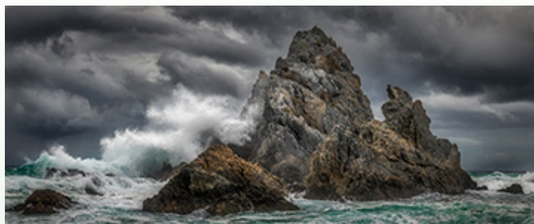
“Stormy Day at Camel Rock” Theme “Weather”