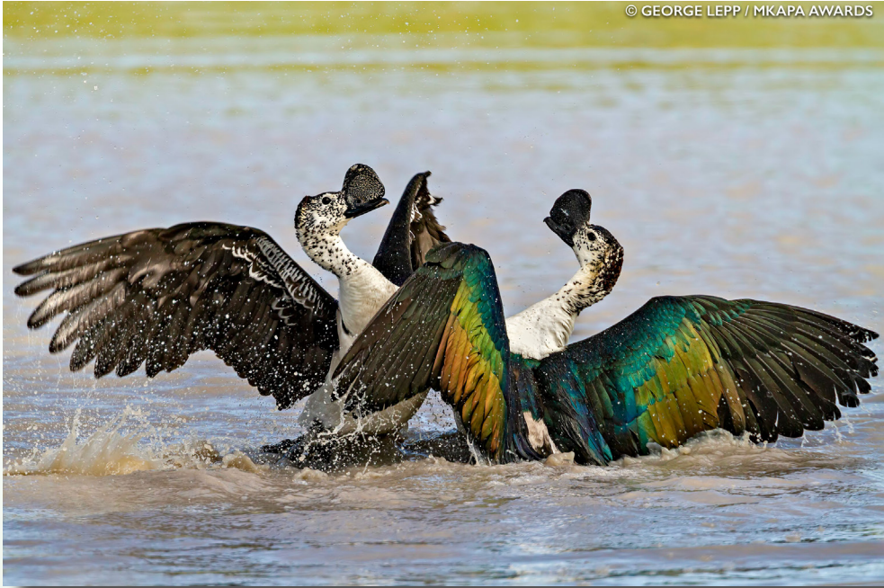
Knob-billed Ducks, Little Vumbura Camp, Okavango Delta, Botswana by George D. Lepp of Bend, Oregon, USA https://spark.adobe.com/page/Dqi3SL3sQik9P/

These images have been selected for the Inaugural Print Exhibition in Nairobi