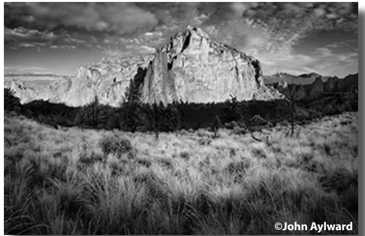
July Images "Black and White"