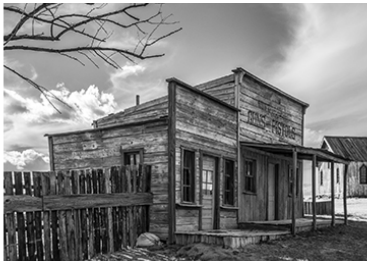
"Santa Fe Movie Set" Theme "Black and White"