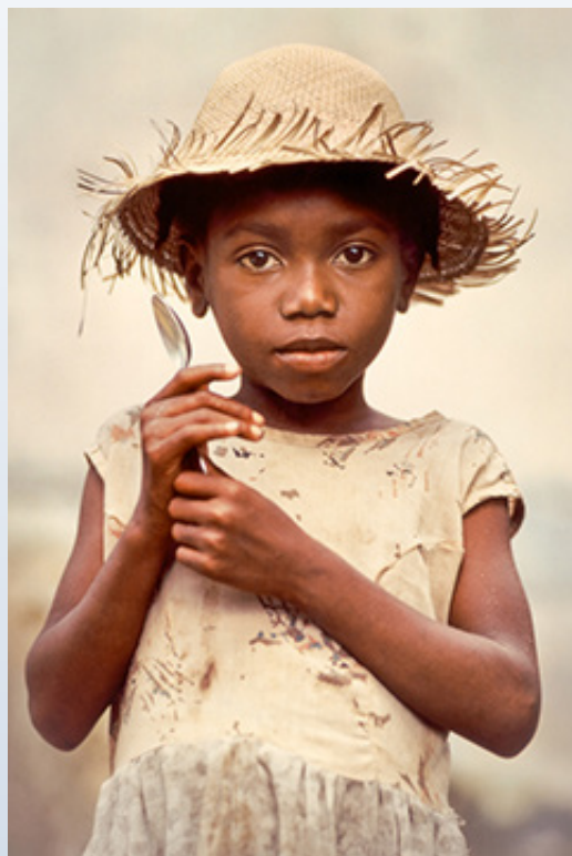
Girl With Spoon - Haiti Theme "Hope"