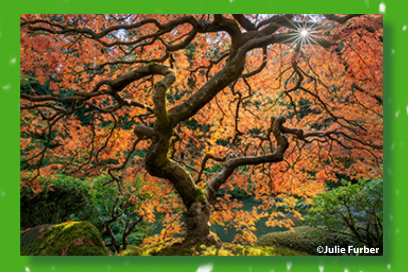
November Theme Images Precious Earth