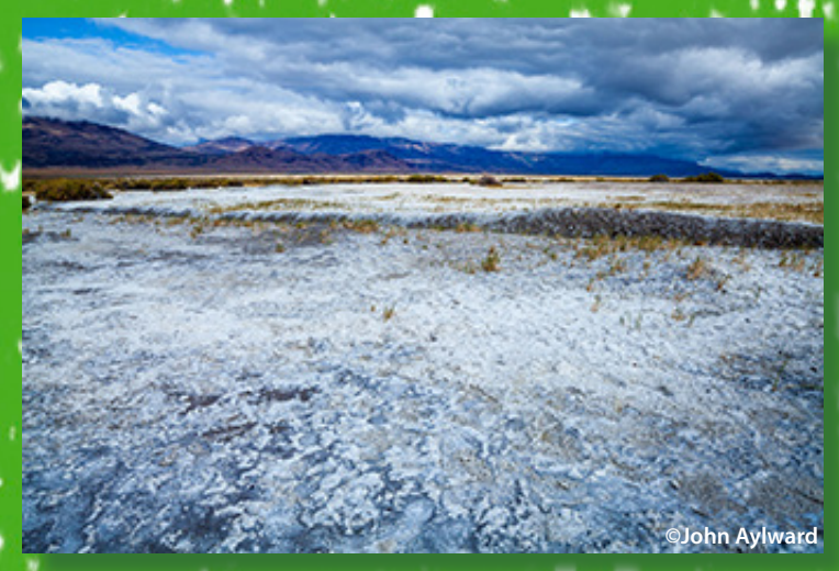
November Theme Images Precious Earth