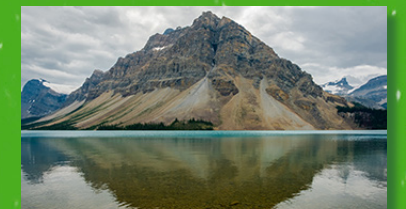
November Theme Images Precious Earth