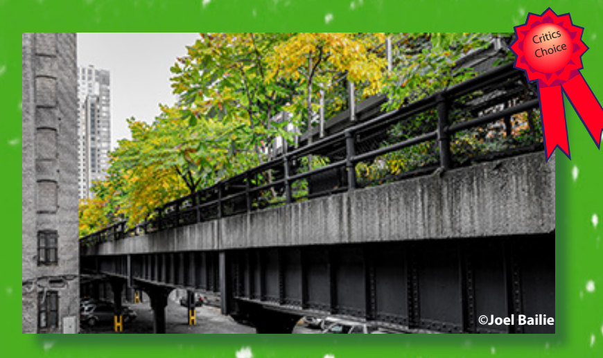
November Theme Images Precious Earth