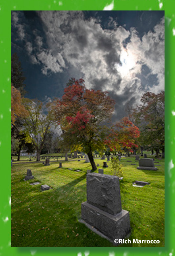
November Theme Images Precious Earth