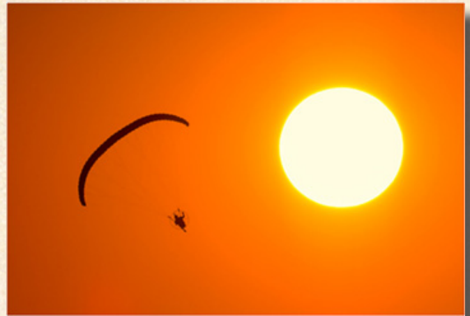
“Icarus” ©Dan Schafer Theme “Hot Stuff”