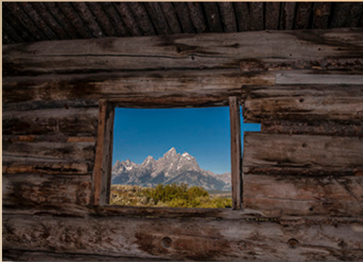
September Theme Images Window