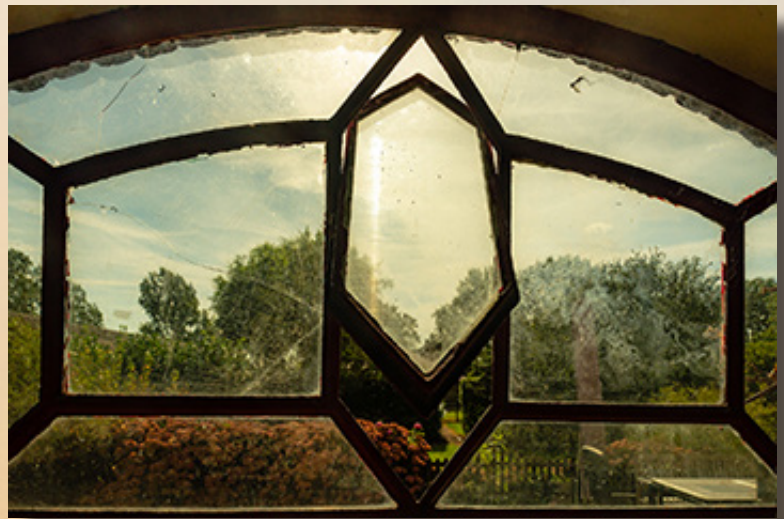
“Netherlands Factory Window” Theme: Window