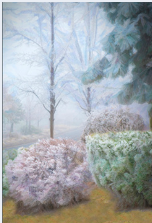
“Cotton Candy Lane” Theme “Fantasy”