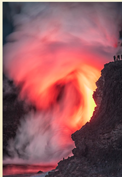
“Mauna Loas Fire Hose” Theme “Heat”