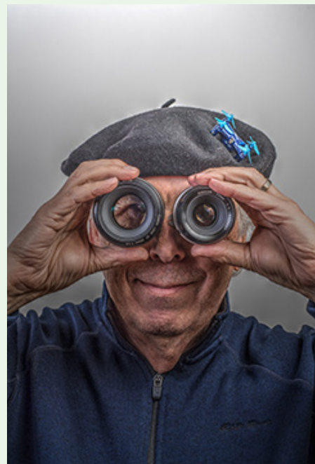
"The Maestro" Theme "Self Portrait"