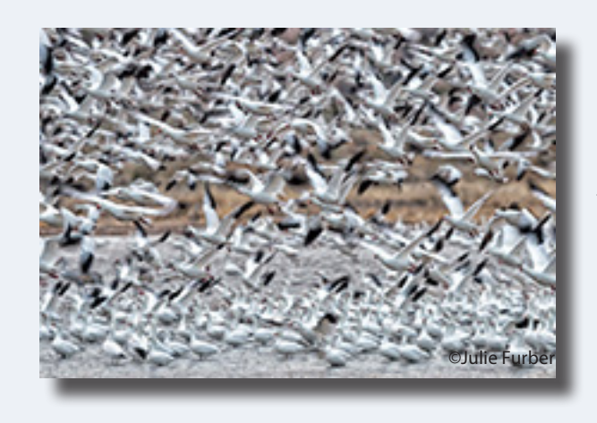
Member Images February Theme: Motion