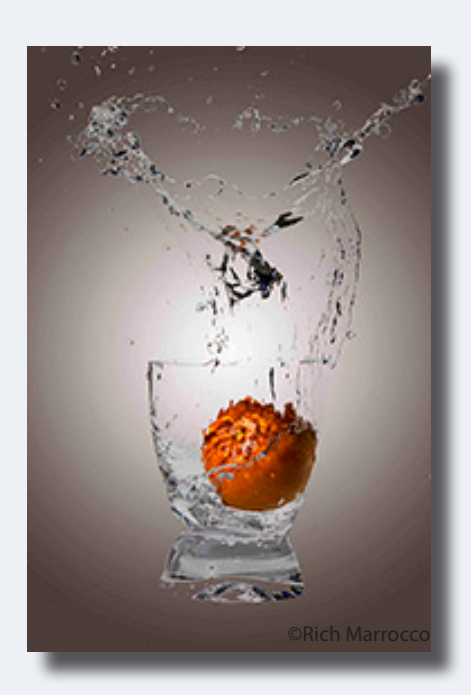
Member Images February Theme: Motion