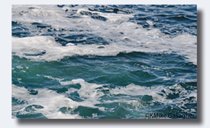
Member Images February Open