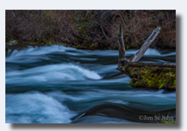
Member Images - February Theme: Motion