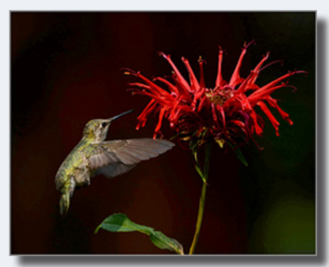
"Just Hummin' Along" ©Eileen Riley Theme "Motion"

Photo Talk Lunch at Cafè Sintra 11-1 PM 16th