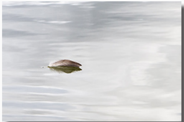
“Drifting” Theme “Simplicity”