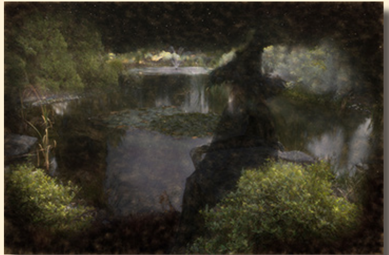
“Late One Night” ©Blanche Feekes Theme “Mysterious”