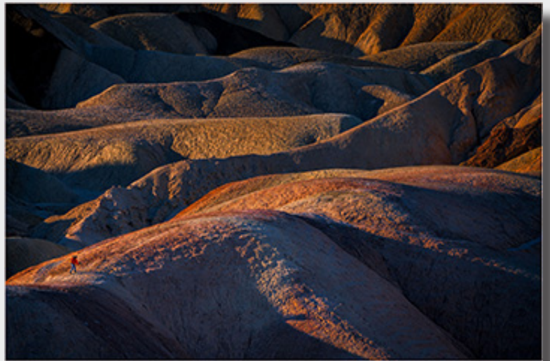
“Morning Stroll at Zabriskie Point Theme “Hills and Valleys”