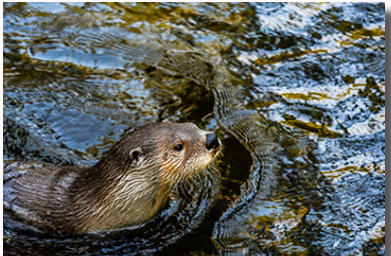
“Making Waves” Theme “Critters”